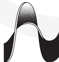
Left hand pitch