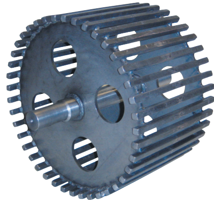
Bechtel open pulley